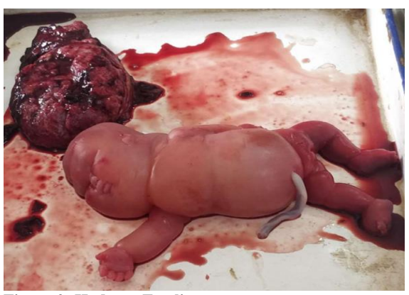
Figure 2: Hydrops Fetalis